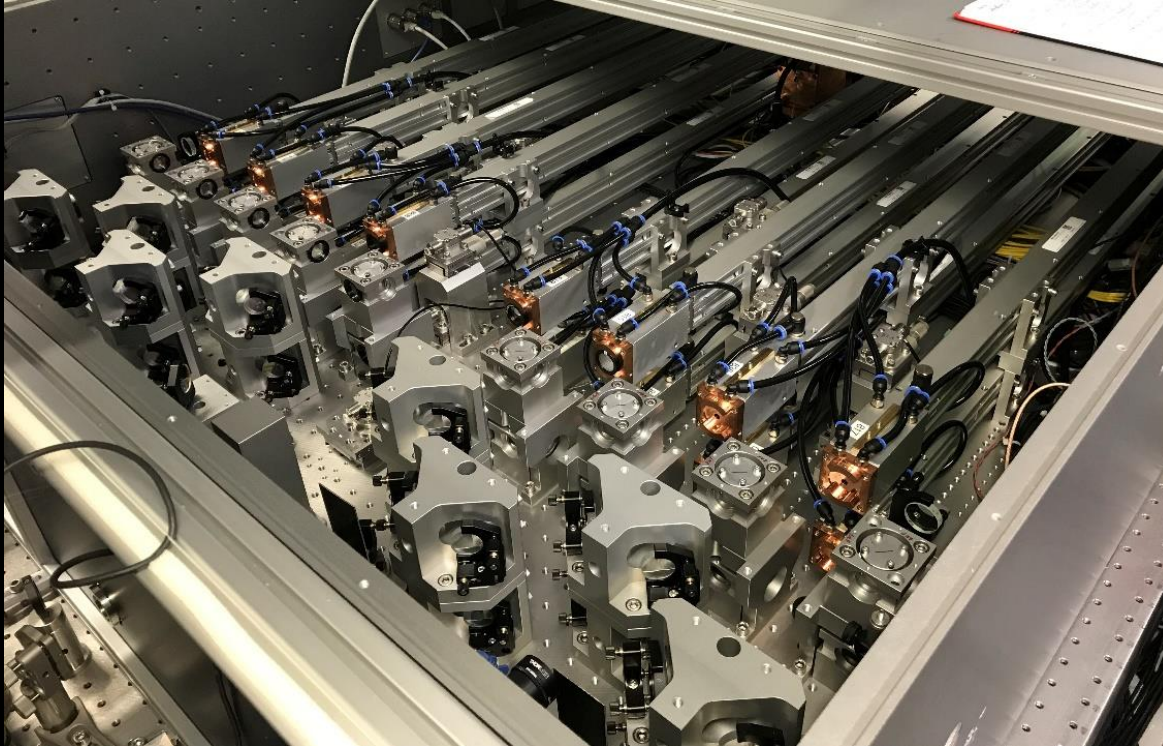
Ultrafast fiber CPA system

Potential Bachelor thesis topic: „Automated alignment of beam arrays for coherent combining“